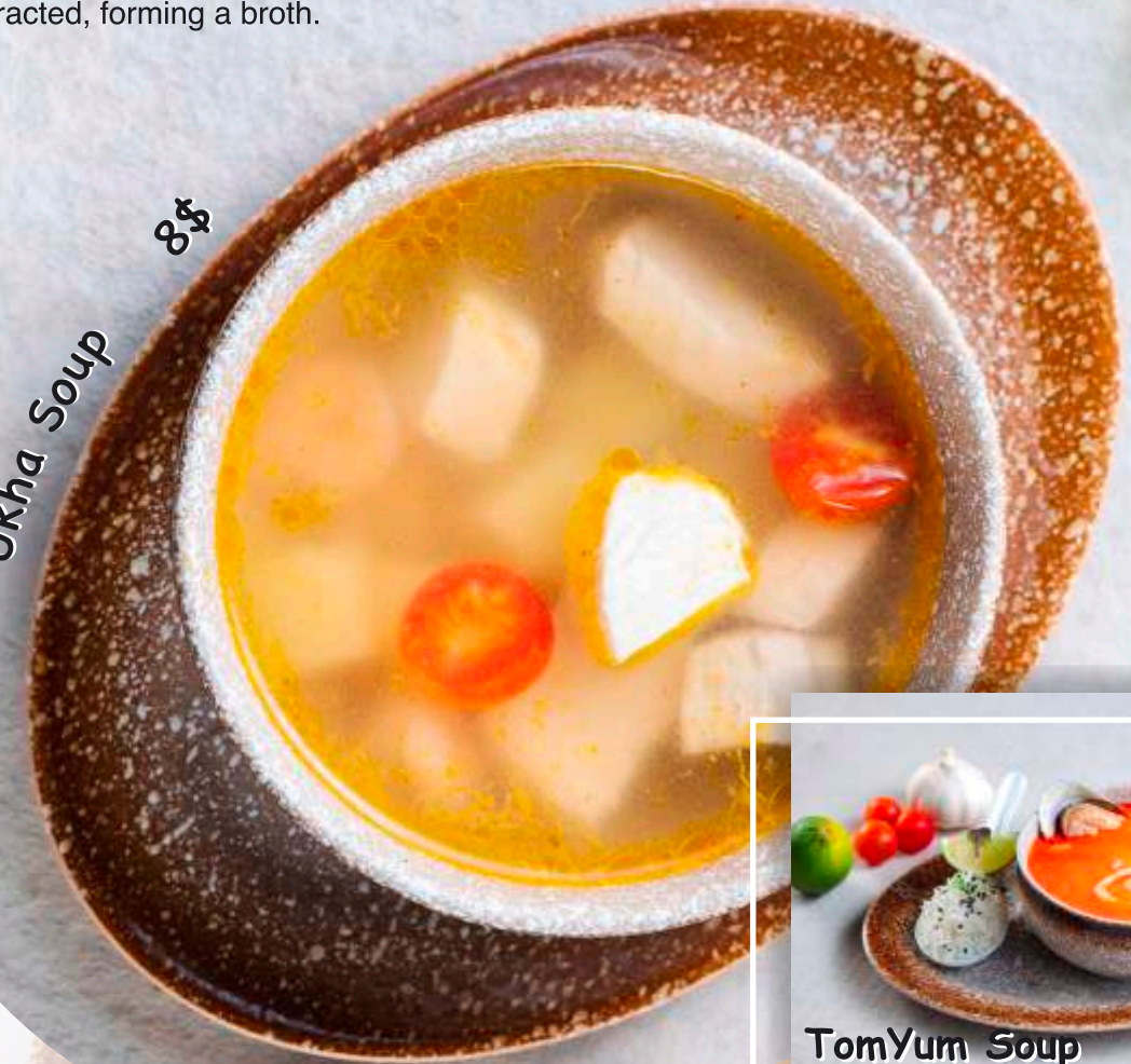
8$ Ukha Soup

Soup is a primarily liquid food, generally served warm or hot (but may be cool or Cold), that is made by combining ingredients of meat or vegetables with stock, or water. Hot soups are additionally characterized by boiling solid ingredients in liquids in a pot until the flavors are extracted, forming a broth.