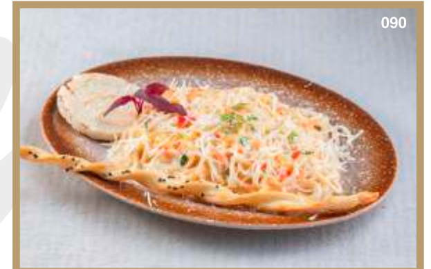
090 PUMPKIN CHICKEN PASTA 11$