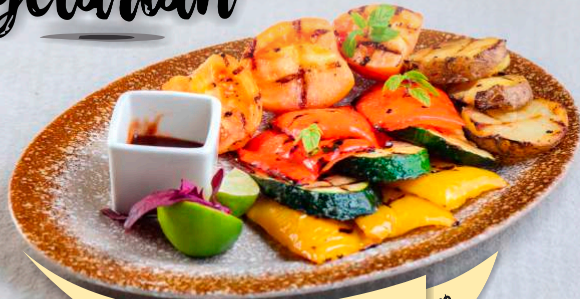
083 Grilled Vegetables 7$