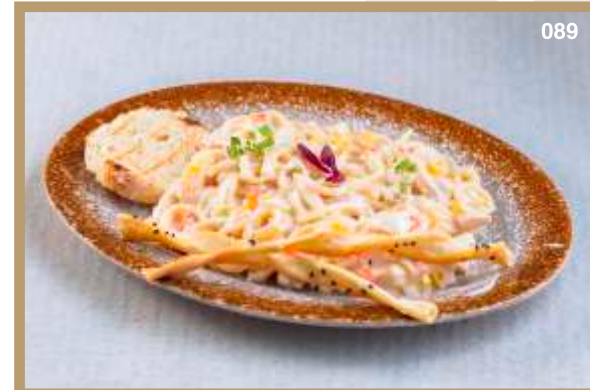
089 VEGETABLE PASTA 11$