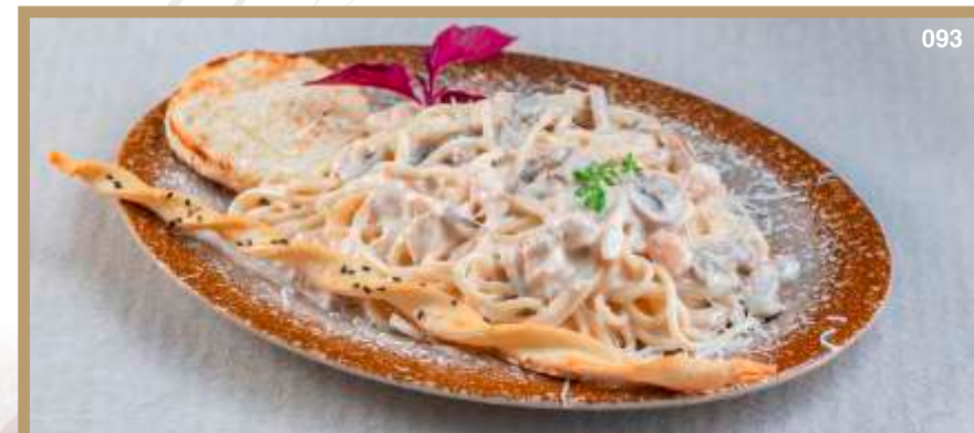
093 CHICKEN MUSHROOM PASTA 11$