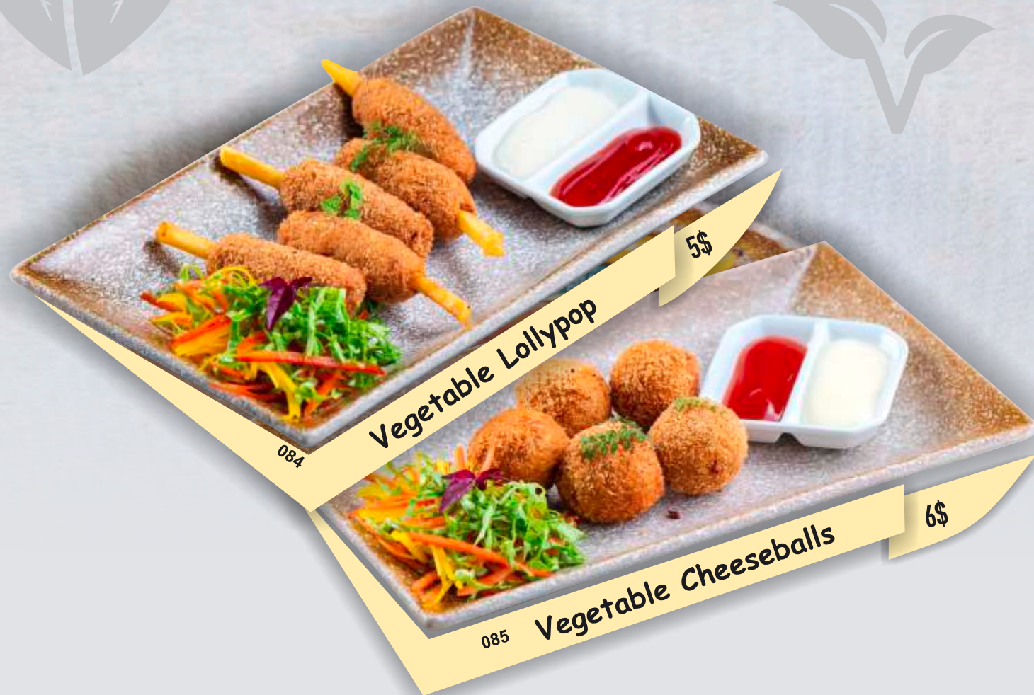
084 Vegetable Lollypop 5$