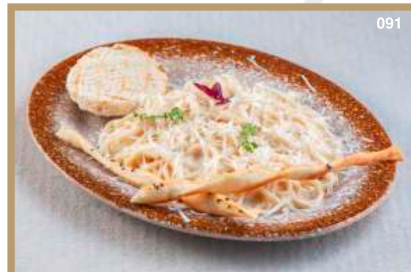
091 CREAMY PASTA 11$