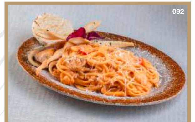
092 SEAFOOD PASTA 13$